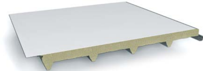
Particolare del giunto Joint detail

Roof double sheet panel with mineral wool with flat coating in weatherproofing synthetic PVC or Polyolefin membrane