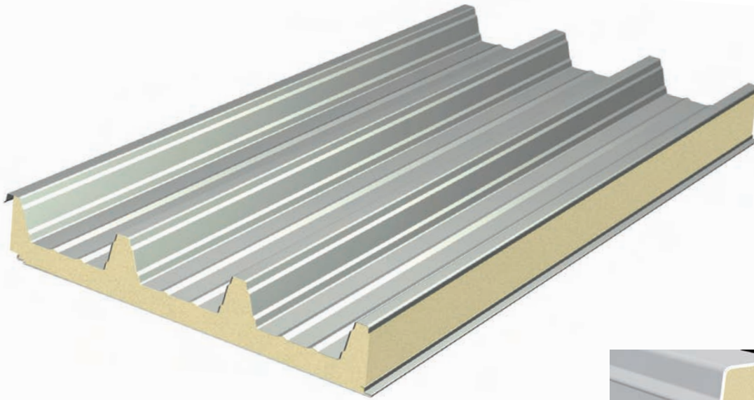
PARTICOLARE DEL GIUNTO JOINT DETAIL

Panneaux de couverture avec isola- tion en mousse PUR / PIR